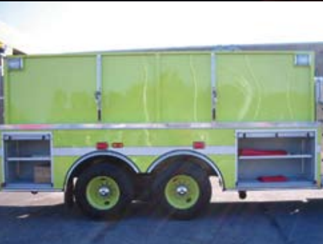
Low side compartments