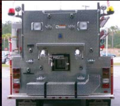
Standard 10" square rear dump