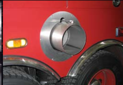
Optional side dumps between tandem axles

These are the typical specifications for the Liberty™ Tanker by American LaFrance: