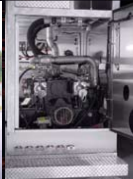
Full access to pump house