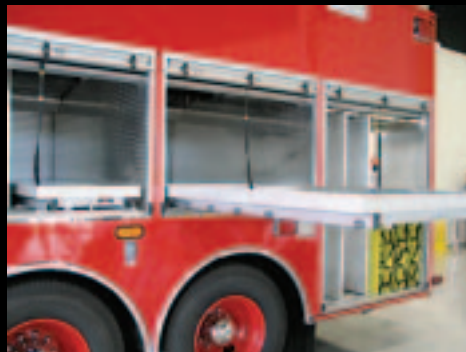
1000 lb rated full extension trays