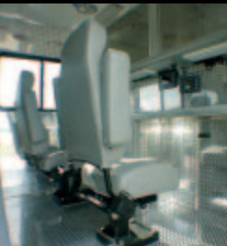
Dual Command seating with desk