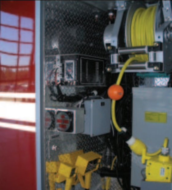
Generator and light tower controls