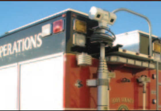
Mast mounted camera systems