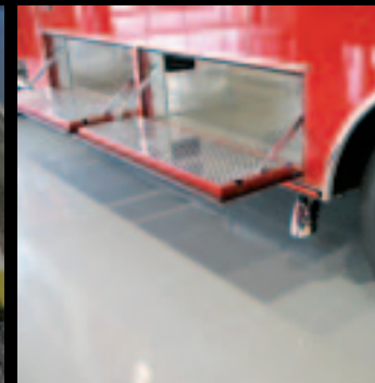
Under body storage compartments